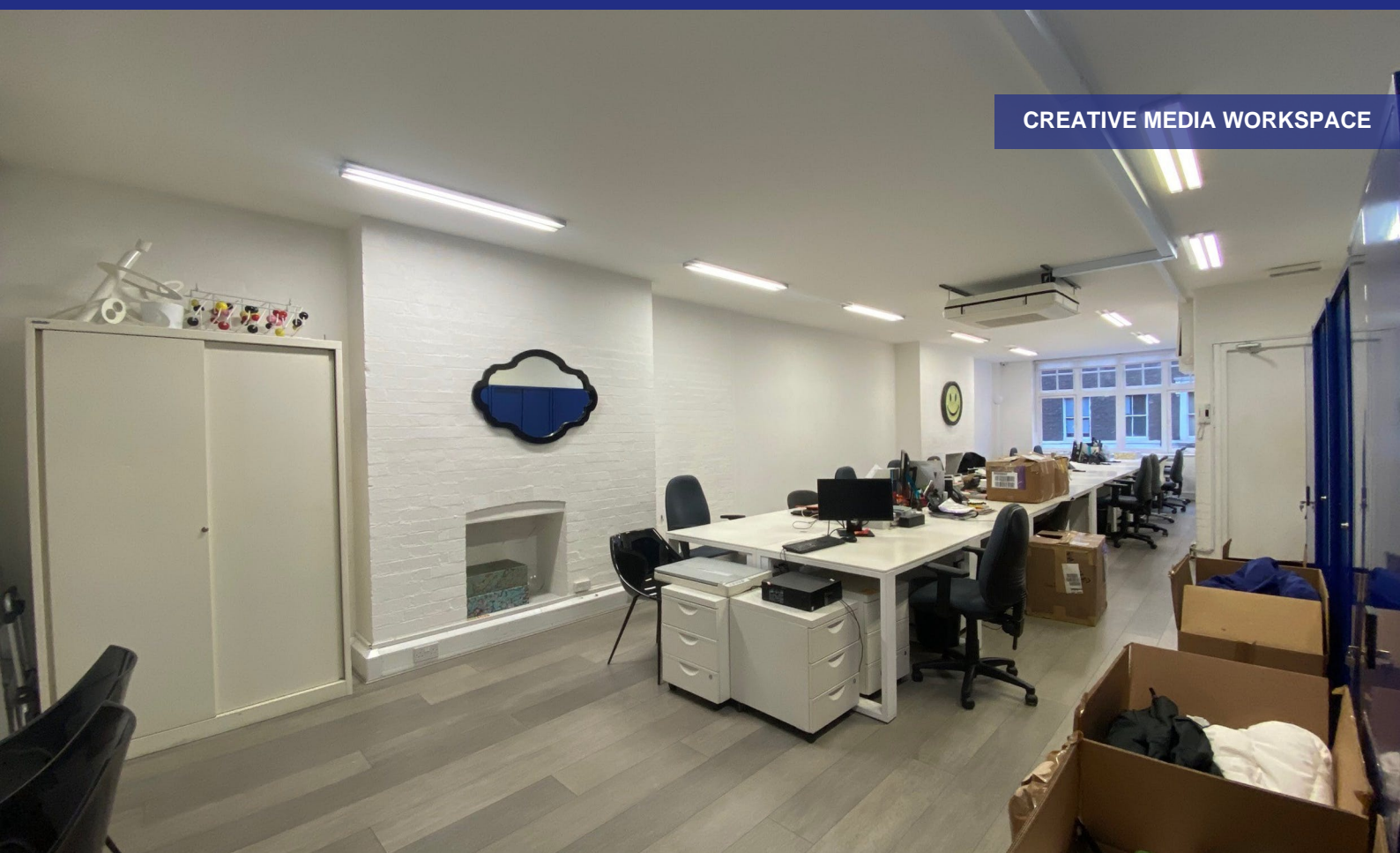
CREATIVE MEDIA WORKSPACE